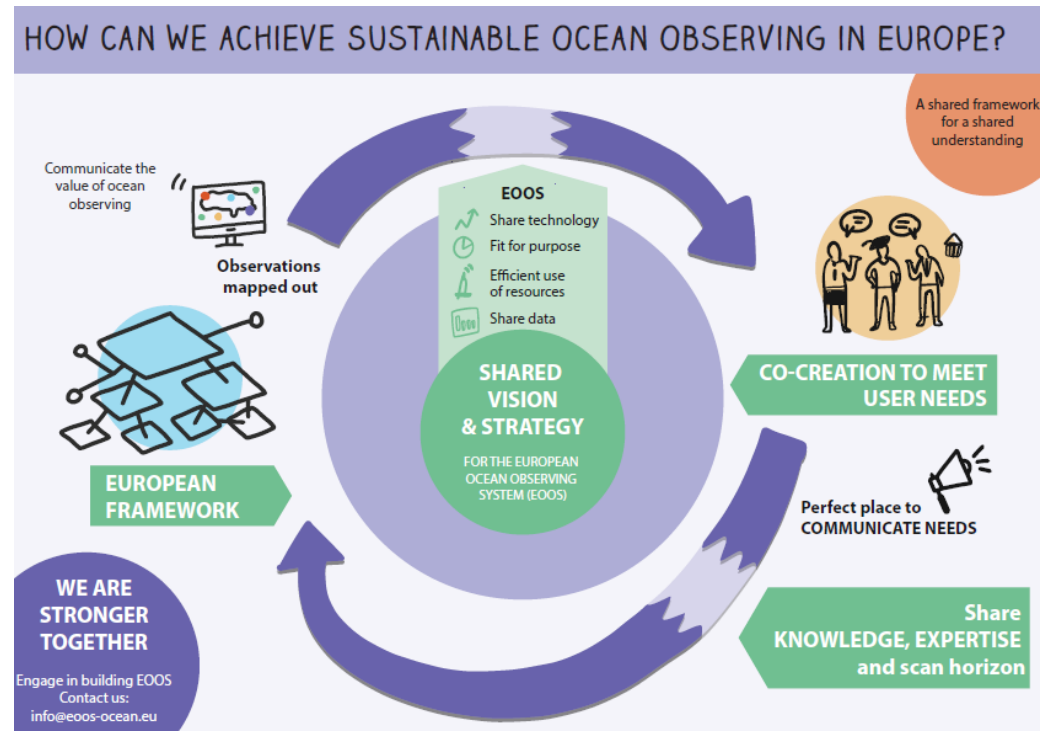
Figure 1: a) The existing challenges and untapped potential of fragmented dispersed ocean observing efforts, and b) The added value of a coordinated European Ocean Observing System framework